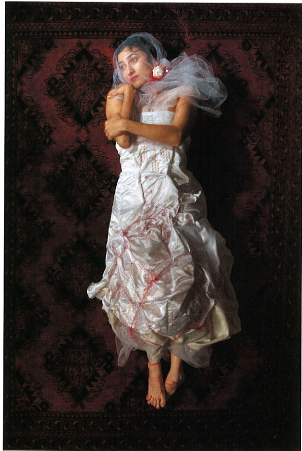
Upon my Daughter , C-Print, 20x30" (50.8x76.2 cm) 2010