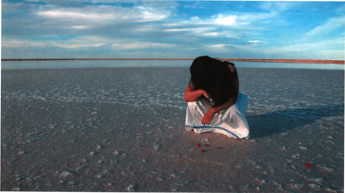
Left , Video Still, 2011