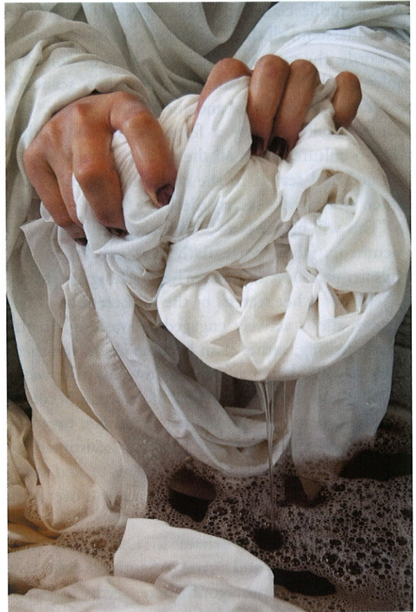
"This will be the last--" (The quote and dashes are part of the title), C-Print, (50.8x76.2 cm), 2009

In the act of preparing the bride, the women have partaken in continuing patriarchy and enmeshing, very much like a captured fish, in the veils and traditions of marriage, not only for the young girl, but the family as well. Samizay's circle of matriarchs leave the young bride on the burgundy Afghan